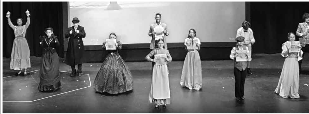
Little Women - Ensemble